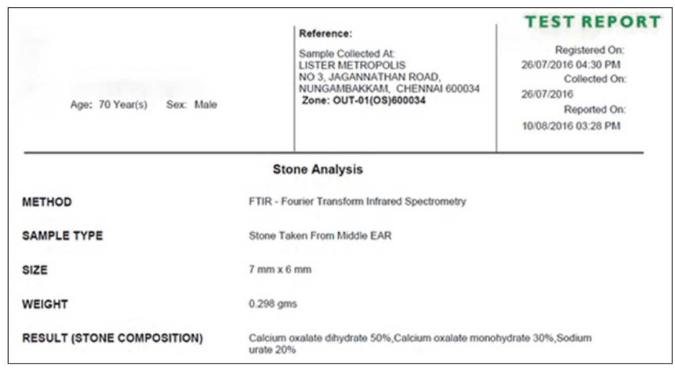
Fig. 2 Fourier transform infrared spectrometry report of the mass from the right middle ear cavity.

The possibilities of foreign bodies, general and local metabolic disorders, and calcified tuberculous lesions were taken into consideration. Foreign bodies could be excluded as a causative agent and nucleus for calcium precipitation and calculus formation, because no traces of foreign bodies of any kind were detected during thorough oto-endoscopic examination of the middle ear cavity.