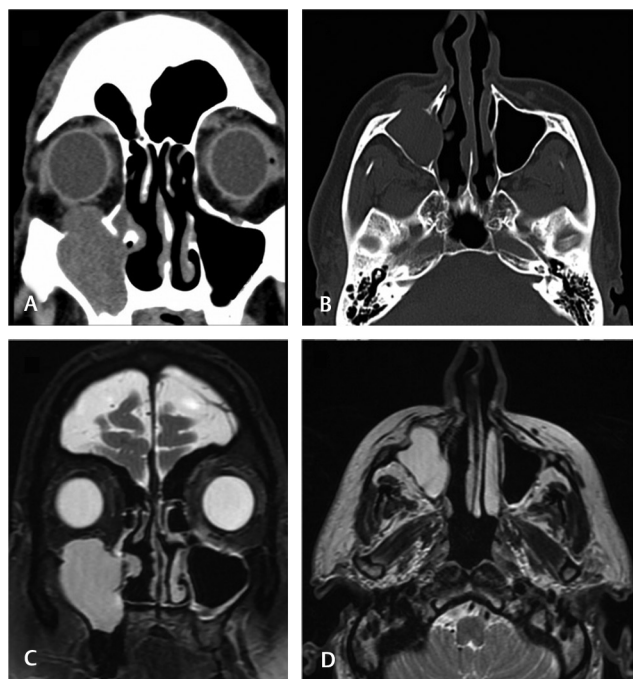
Fig. 1 (A) (coronal plane computed tomographic (CT) image; soft tissue window): expansive soft tissue density lesion originating in the right maxillary sinus and intraorbital component, causing right eye hypertropia. (B) (axial plane CT image; bone window): totally opacified right maxillary sinus; bulging of the lateral nasal wall; dehiscent anterior maxillary sinus wall; limited subcutaneous component of the homogeneous lesion; signs of inferior turbinectomy. (C) (coronal plane T2 magnetic resonance imaging (MRI) scan): hyperintense expansive maxillary lesion with intraorbital component that modulates inferior rectus and oblique muscles. (D) (axial T2 MRI scan): hyperintense lesion protruding through the dehiscent anterior sinus wall.

in centered, right, and left head-tilt positions, respectively. With no head-tilt, prism diopters were the same in right and left gaze. No other pathologic signs were detected.