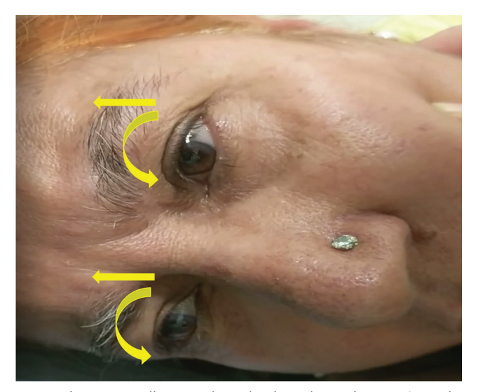
Fig. 5 The supine roll test to the right elicited an upbeating (straight arrows) counterclockwise torsional (curved arrows) positional nystagmus, indicating a second canal switch from right horizontal to the right posterior semicircular canalolithiasis.

Appiani maneuver is performed with the patient in short sitting with her lower limbs hanging down the long edge of examination table. From the upright short sitting, a brisk right (ipsilesional) lateral recumbent positioning is done (step 1), and after a minute, the patient's head is inclined 45-degree upward in the yaw axis and maintained for 2 min (step 2). Thereupon, the patient was positioned upright in the short sitting, completing the Appiani maneuver. Online content including video sequences viewable at: https://www.thieme-connect. com/products/ejournals/html/10.1055/s-0040-1702757.