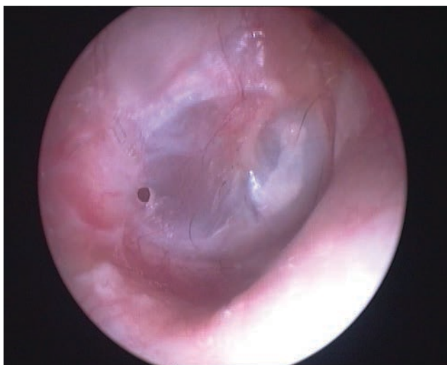
Fig. 2 Otomicroscopic picture of right tympanic membrane of the patient with posteroinferior of area 1 mm 2 (small size) with no hearing loss.

the test ear was comparatively the poorer one and if sounds of \geq 45 dB were used for the tests. The mean HL was calculated through the pure-tone average taken at 500, 1,000, and 2,000 Hz for each site of perforation. 1-5,13