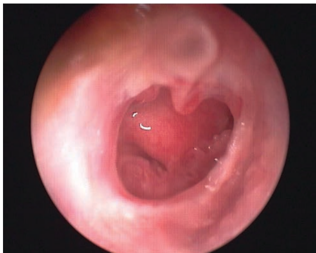
Fig. 1 Otomicroscopic picture of right tympanic membrane with central perforation of area 42 mm 2 (large size), with air-bone gap of 18 dB HL in low-volume group.