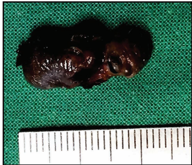
Fig. 2 Excised specimen from left external auditory canal (2.3 × 0.6 × 0.7 cm).

of the abdomen and chest to rule out any distant organ metastasis. Positron emission tomography scan was done after 6 weeks and no residual local lesion or distant metastasis was identified. The oncology board's opinion was taken. The patient was kept under close observation with monthly periodic evaluation in the initial 1 year and then for 3 to 6 monthly follow-up. At 1 year, she was evaluated with contrast-enhanced computer tomography of the abdomen and ultrasound of the neck and chest X-ray. The patient did not show any locoregional recurrence or any features of distant metastasis till the last follow-up, that is, 4 years after her illness.