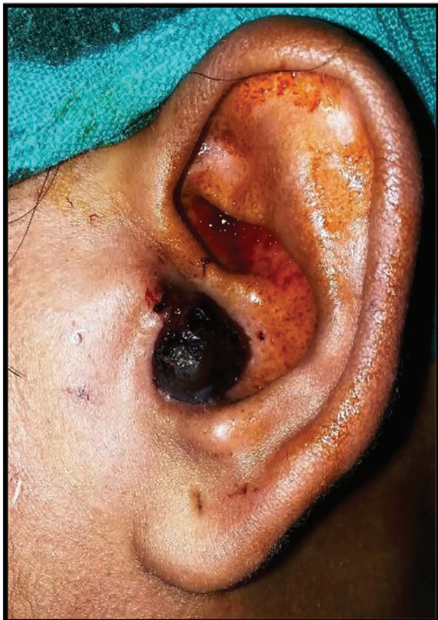
Fig. 1 Malignant melanoma occluding left external auditory canal.

After histopathological diagnosis, the patient was evaluated immediately with contrast-enhanced computer tomography