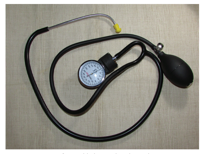
Fig. 1 Prototype of assembled Eustachian barotubometer.

pharyngeal end of ET by nasopharyngoscopy (NPS) was the secondary outcome.